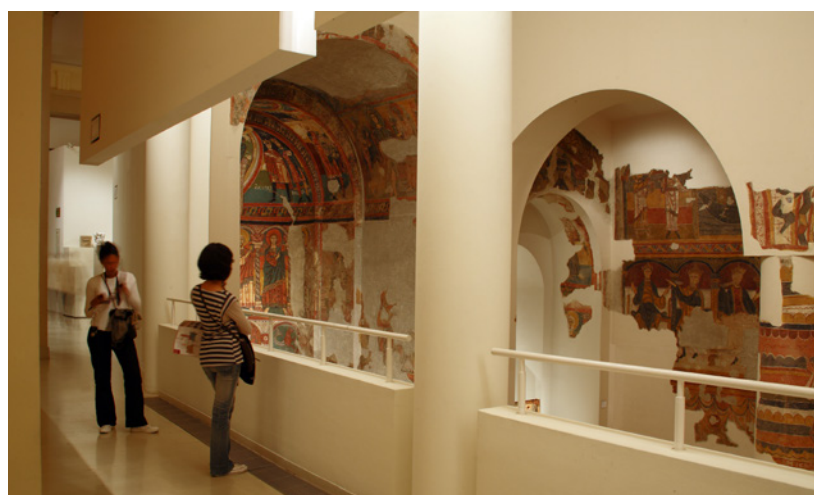
▲ INTERIOR OF THE MNAC

CaixaForum: have fun in one of Spain's most prestigious cultural centres. It offers a wide range of temporary exhibitions, conferences and educational activities for the whole family.