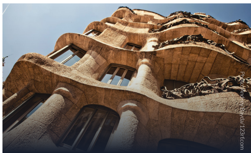
▲ LA PEDRERA