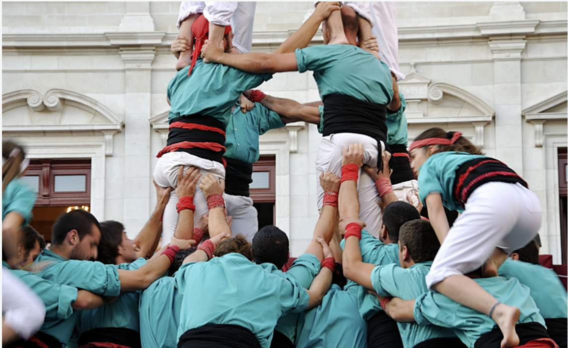
▲ CASTELLERS (HUMAN TOWERS)

The mildness of the Mediterranean climate means any time is good to visit Barcelona, but each season offers you something unique. Take note: