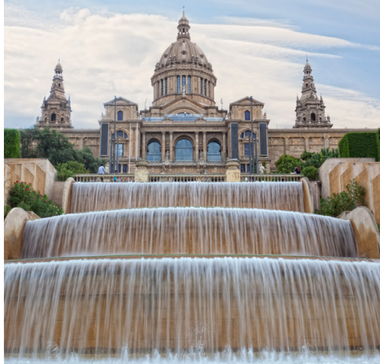
▲ NATIONAL PALACE

At the foot of Montjuïc you will find the Plaça d'Espanya , the confluence of some of Barcelona's most vibrant streets, such as Parallel and Gran Vía . Close by is Joan Miró Park . There you can enjoy a relaxing stroll and take a look at the Woman and Bird Sculpture ,