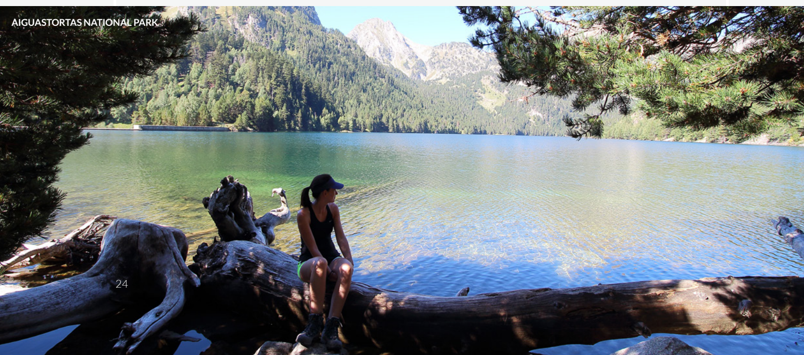
AIGUASTORTAS NATIONAL PARK

Cadí-Moixeró Nature Reserve , straddling the provinces of Barcelona, Girona and Lleida, is an ideal place to visit on foot, horseback or bicycle. Another great beauty spot is the La Garrotxa Volcanic Area Nature Reserve (Province of Girona): visit it and marvel at one of the best examples of a volcanic landscape in Spain.