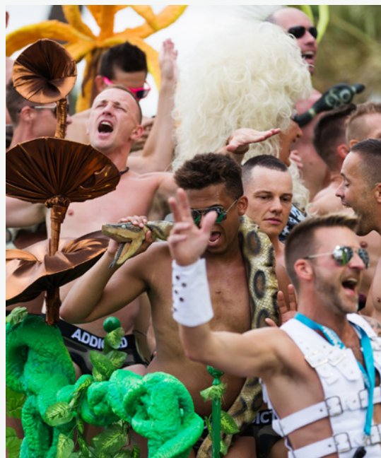
▲ GAY PRIDE SITGES

Just over 20 minutes from Barcelona you will find Sitges , a stunningly beautiful town and an LGBTI+ paradise. Stroll along its beaches and streets, which inspired a generation of Catalan artists from the late 19th century.