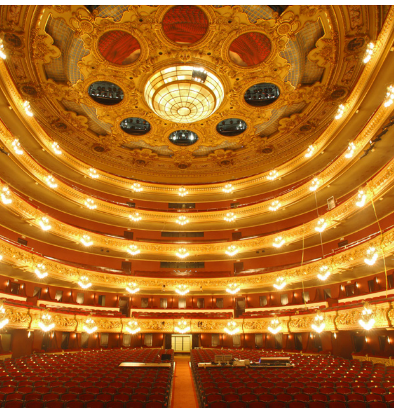
▼ LICEU THEATRE