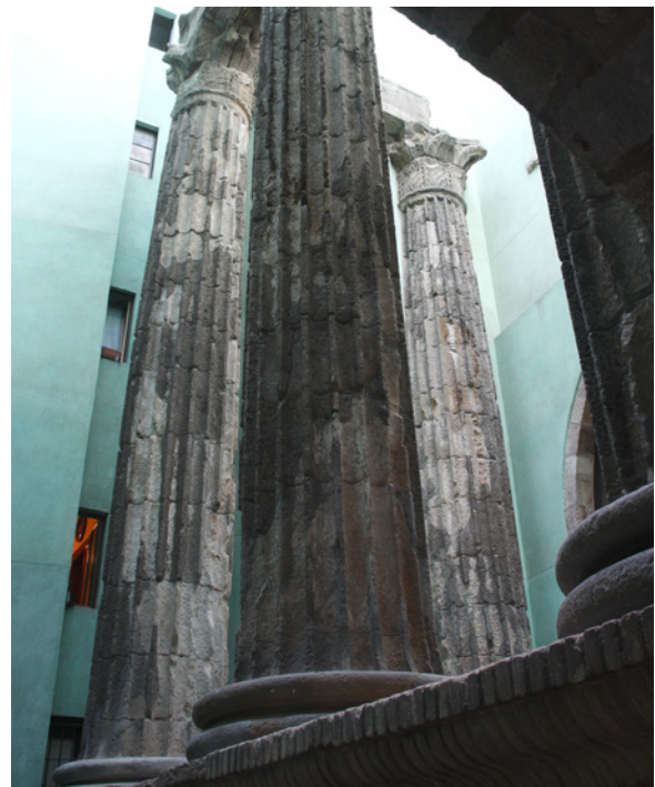
▲ AUGUSTUS TEMPLE

ria del Pi Basilica , Santa Maria del Mar Basilica and the Romanesque Sant Pere de les Puelles Monastery .