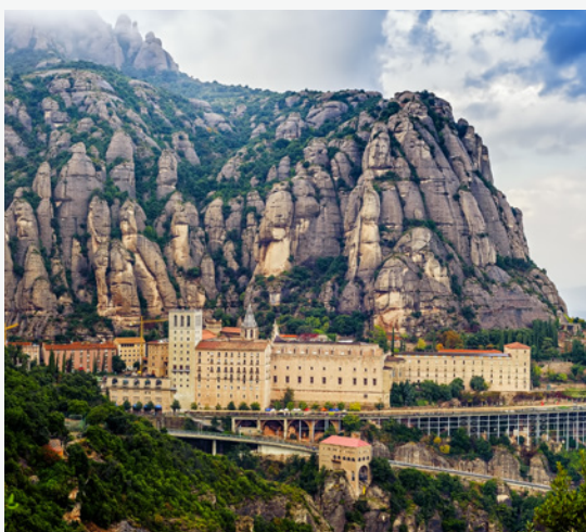
▲ SANTA MARIA DE MONTSERRAT ABBEY

In Figueres (Province of Girona) you will find the surrealist Salvador Dalí Theatre-Museum and the biggest 18th century fortress in Europe: Sant Ferran Castle. Also not to be missed are the waterfalls at the source of the Llobregat River , in the town of Castellar de n'Hug. It is delightful to see the water gushing to form beautiful waterfalls.