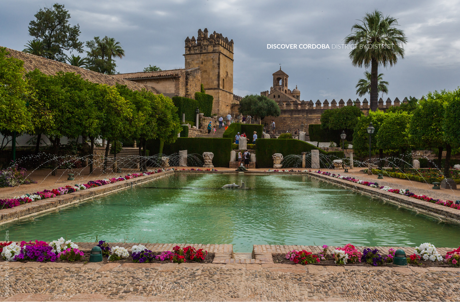
▲ ALCÁZAR DE LOS REYES CRISTIANOS FORTRESS