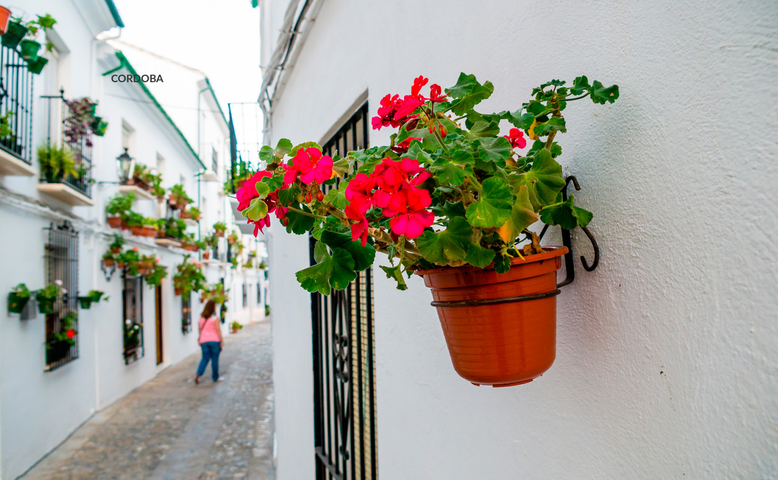
▲ PRIEGO DE CÓRDOBA

If you want to explore one of the oldest towns in the region, head for the lovely Cabra . Surrounded by mountains, springs and natural sites of great beauty, it preserves its Al-Andalus past in its double walled enclosure and in the beautiful Condes de Cabra castle. It also has some of the most interesting Baroque architecture in Andalusia, with such jewels as the parish church of Nuestra Señora de la Asunción y Ángeles.