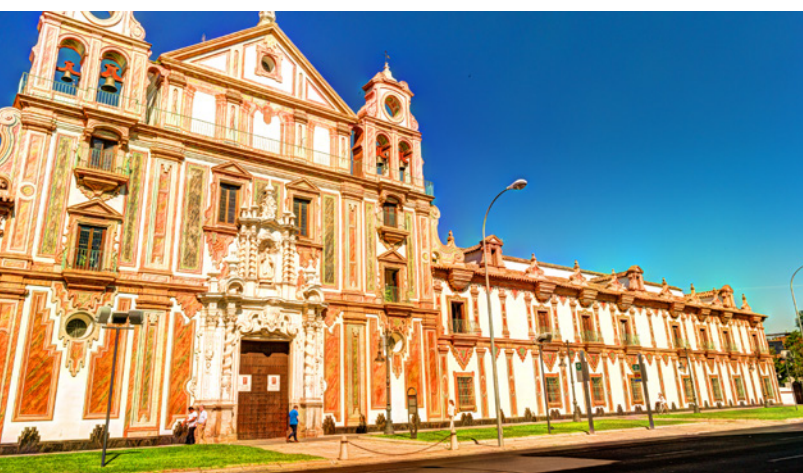
▲ LA MERCED PALACE

There are also interesting art centres like the Palacio de la Merced , a former convent that hosts temporary exhibitions. The building is one of the best examples of Córdoba's Baroque, with a particularly fine main cloister.