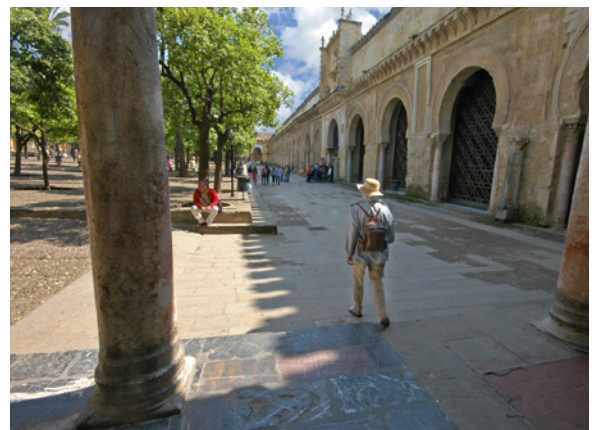
▲ ORANGE TREE COURTYARD GREAT MOSQUE-CATHEDRAL OF CORDOBA

enter through the Puerta del Perdón doorway. The beautiful Orange Tree Courtyard leads to the incredible forest of columns with two-tone horseshoe arches in the interior.