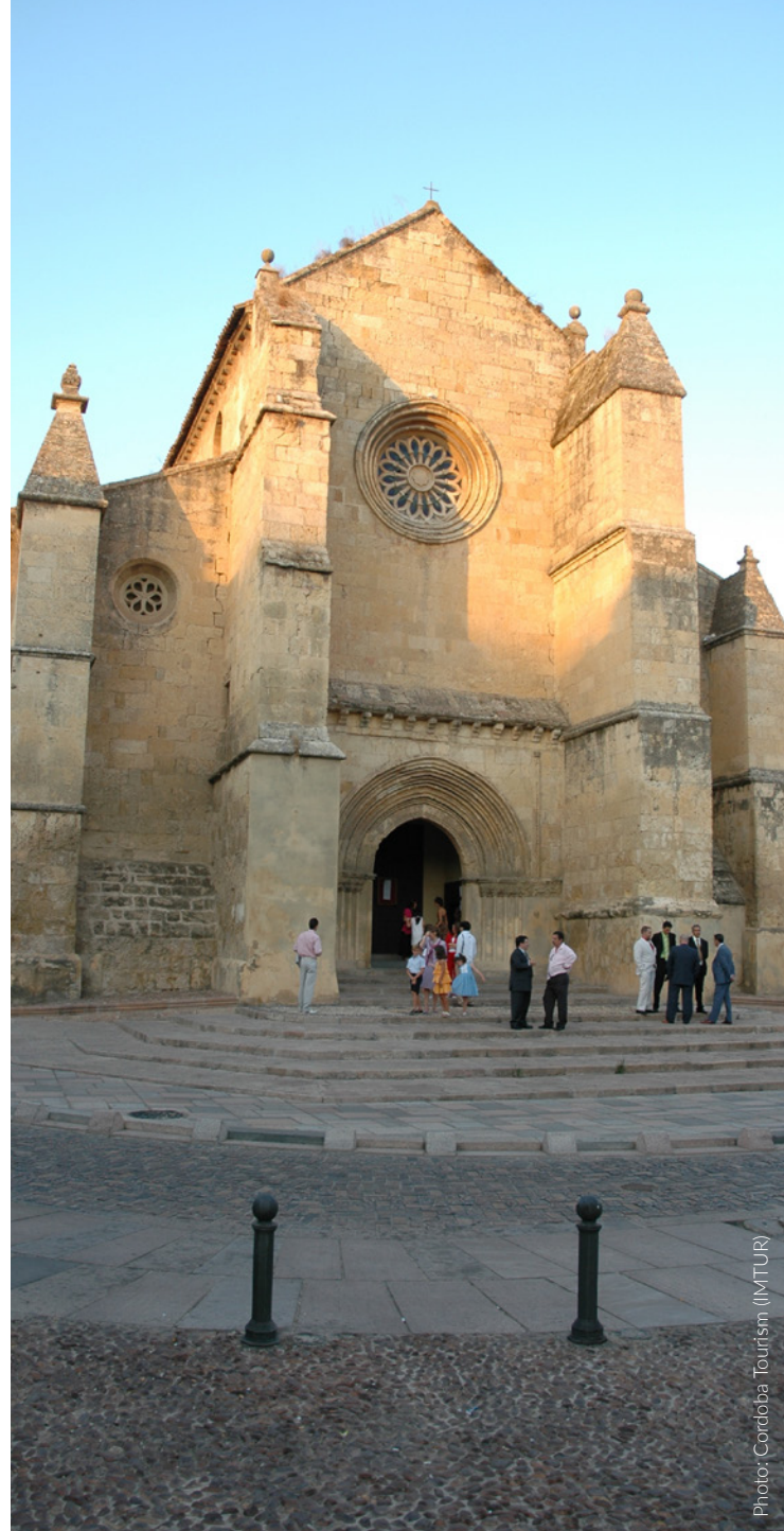
▲ CHURCH OF SANTA MARINA

San Agustín Church has a wonderful interior, one of the jewels of the Baroque in Cordoba. Thanks to its recent restoration, beautiful murals and frescos of great chromatic richness are now visible. It has many similarities with the chapels of San Cayetano Church , located on a steep street called Cuesta de San Cayetano. It has stunning vaults and decorative details.