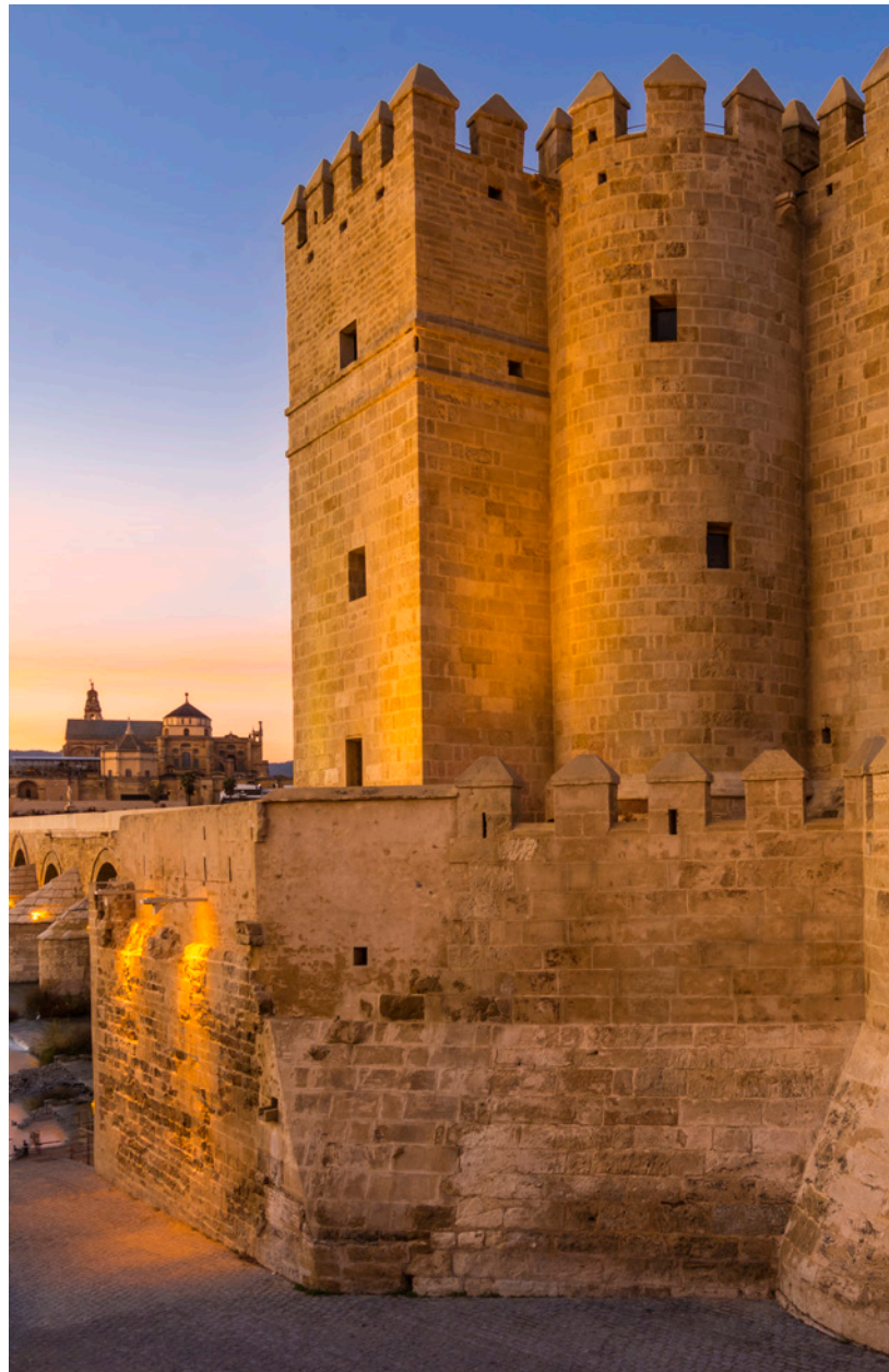
▼ CALAHORRA TOWER

If you are looking for a fuller panoramic view, 15 kilometres from the city you will find the Las Ermitas shrines complex, a place of religious meditation since the Middle Ages. The site includes a magnificent lookout point under the shadow of the monument to the Sacred Heart of Jesus. From there you will get a wonderful view of the city and part of the Guadalquivir River's fertile plain.