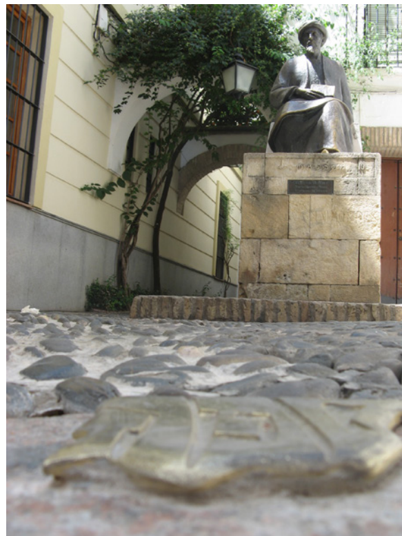
▲ PLAZA MAIMONIDES SQUARE AND THE STATUE OF MAIMONIDES

Also in the Jewish Quarter, documenting the city's Jewish past, is the House of Sepharad - House of Memory . It has